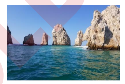
Cabo San Lucas rock formation

Trip Insurance: The Springfield Ski and Travel Club strongly recommends at a minimum the purchase of trip insurance covering accident, sickness or death of a participant or covered family member that would result in cancellation either prior to or during the trip. Travelers are encouraged to purchase "Cancel for Any Reason" insurance if possible (be sure to compare coverage as some packages do not cover the full price of a trip). Your trip insurance should be purchased as soon as possible to ensure complete coverage.